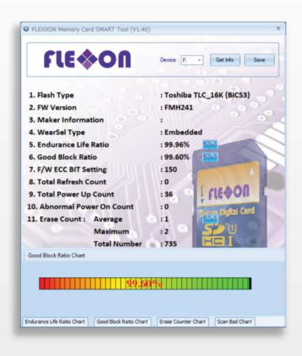
Good Block Ratio Chart