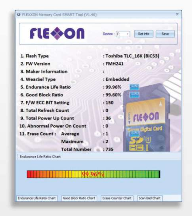
Endurance Life Ratio Chart

Step 3: Flexxon SMART tool also provides the endurance life ratio chart, good block ratio chart, erase counter chart and scan bad block