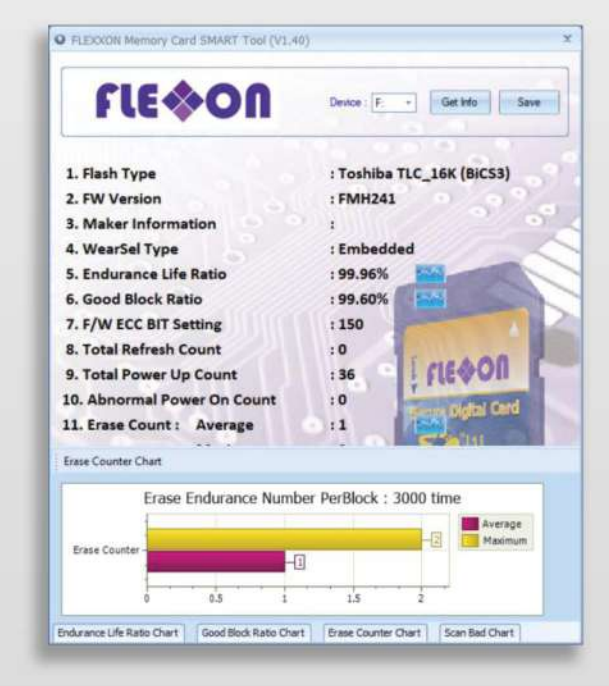
Erase Counter Chart